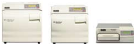
Midmark M11, M9 and M3 Automatic Sterilizers