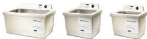
M550, M250 and M150 Soniclean® Ultrasonic Cleaners

Midmark is an ISO 13485 and ISO 9001 Certified Company. For more information or a demonstration, contact your Midmark dealer or call: 1-800-MIDMARK Fax: 1-877-725-6495 Outside the U.S.A. call: 1-937-526-3662 Fax: 1-937-526-8214 or visit midmark.com